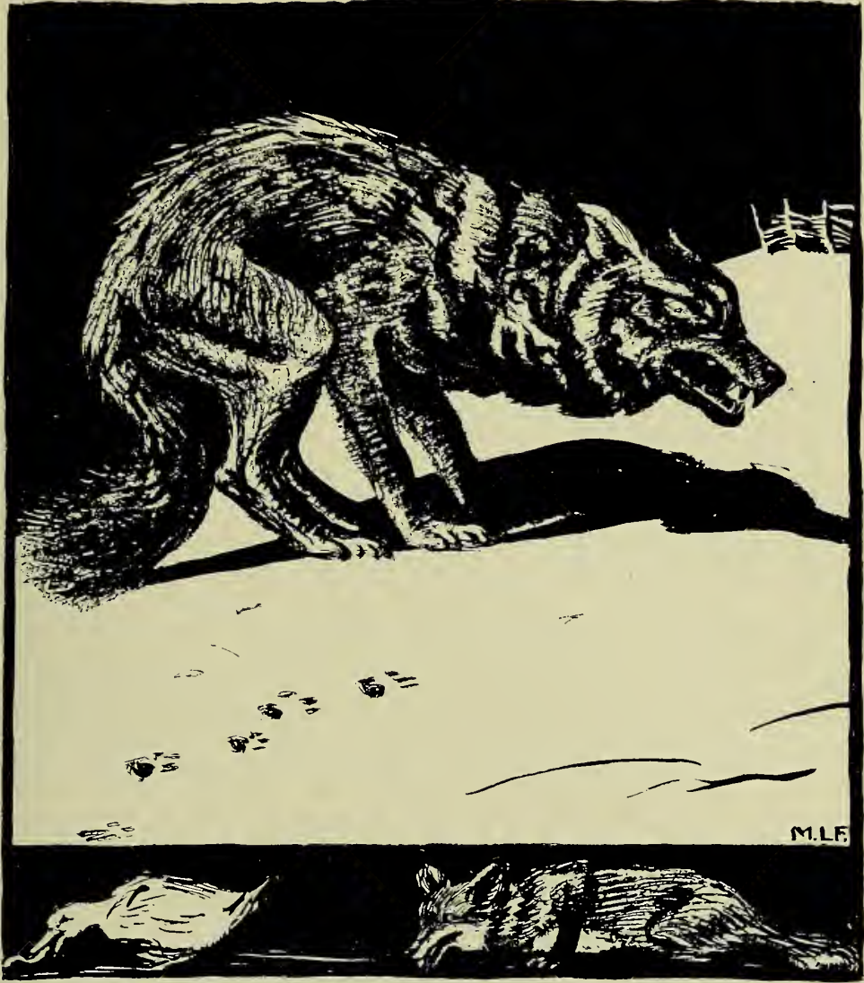
THAT NIGHT AN OLD WOLF CAME THROUGH THE FOREST IN SEARCH OF FOOD